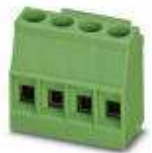
PCB terminal block, Nominal current: 24 A, Nom. voltage: 400 V, Pitch: 5 mm, Number of positions: 4, Connection method: Screw connection, Mounting: Soldering, Conductor/PCB connection direction: 0 °, Color: green, Article with lateral pin exit

Printed-circuit board connector - MKDSO 2,5/ 4-L - 1707234