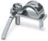
Shield connection clamp for printed circuit terminal block

Components of electronic housing - ME-SAS - 2853899