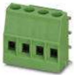
PCB terminal block, Nominal current: 24 A, Nom. voltage: 400 V, Pitch: 5 mm, Number of positions: 4, Connection method: Screw connection, Mounting: Soldering, Conductor/PCB connection direction: 0 °, Color: green, Article with lateral pin exit

Basic terminal block - MKDSO 2,5/ 4-R - 1707247