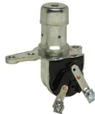
Foot-operated Turn Switch