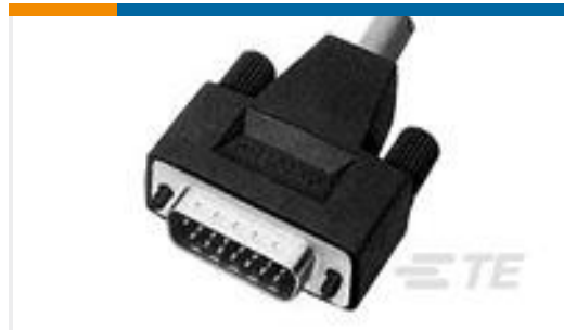
TE Part #1658659-1 KIT,HDP-20,ENCLSUR,PLUG,SIZE 3