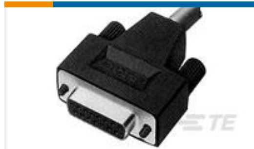
TE Part #1658658-1 KIT,HDP-20,ENCLSUR,RCPT,SIZE 3