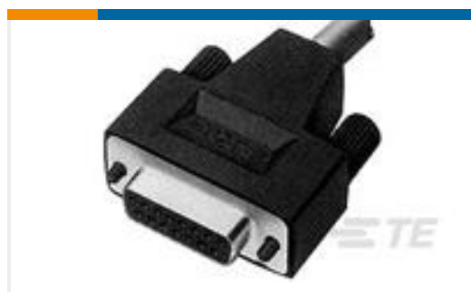
TE Part #1658656-1 KIT,HDP-20,ENCLSUR,RCPT,SIZE 2