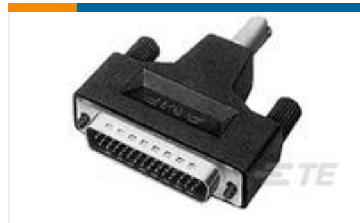
TE Part #5748477-1 KIT,PLUG,78P,HDP-22,SHLD ENCLS