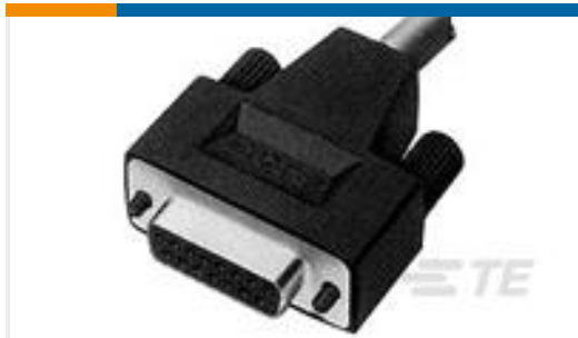
TE Part #1658660-1 KIT,HDP-20,ENCLSUR,RCPT,SIZE 4