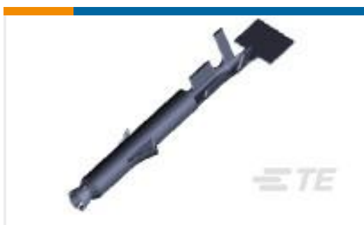
TE Part #170361-3 MINI UNIVERSAL M-N-L SOCKET