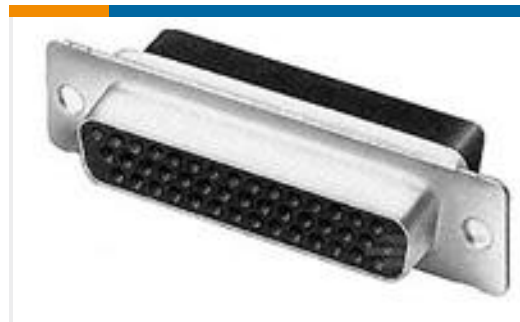
TE Part #1658685-1 HDP-22,RCPT,SIZE 5,78 POSN