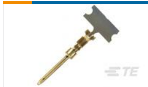
TE Part #1658539-1 PIN CONT DUPL PLT STRIP HD-20