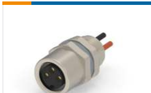
TE Part #T4073014031-001 M8.FMLE.PNLFRONT.3POS.STR WIRE