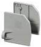
Flange cover, Color: gray