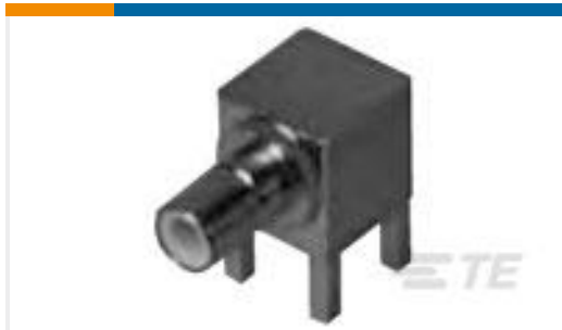
TE Part #415340-1 PCB JACK, RTANG, SMB