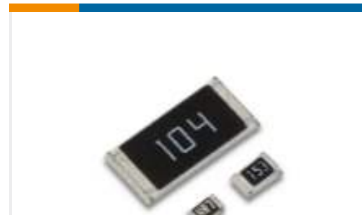
TE Part #2176337-6 CRGCO 0402 27R 1%