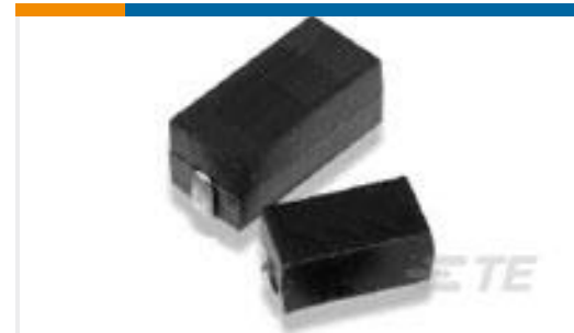
TE Part #1-1879233-3 SMW5 R33 5%