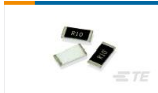
TE Part #2-1879463-1 RL73H 2E R68 1% 5K RL