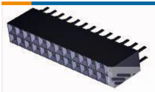
TE Part #6-534206-3 26 MODII VRT DR CE 100/115