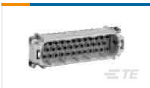
TE Part #2-1104012-3 HVT.35.STI.C