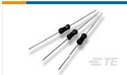
TE Part #3-1879352-4 RR02 5% 7R5 AMMO