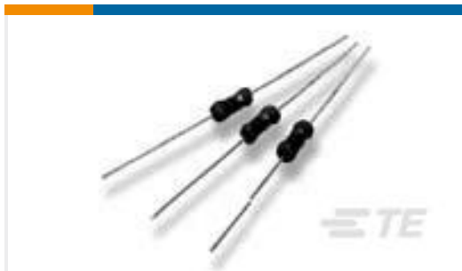
TE Part #3-1879350-8 RR01 5% 7R5 AMMO