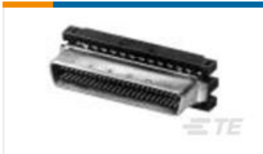
TE Part #5749621-5 50 50S CABLE PLUG CONN/COV KIT