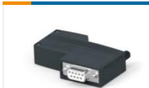
TE Part #103668-E ERBIC BUS C BUS-SYSTEM SYS CAN HO KN CU