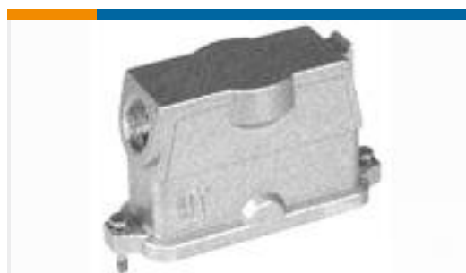
TE Part #2-1102660-5 HIP-K.24/64.STS.1.2