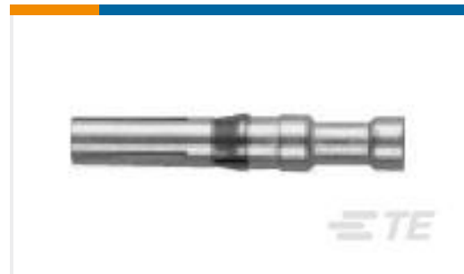
TE Part #2-1105301-1 HVT-C-Bu.Ag.0,75-1,0 qmm