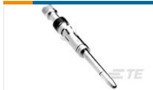
TE Part #204219-1 PIN CONTACT ASSY.