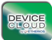
Device Cloud Solutions