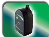
SE Range Extenders