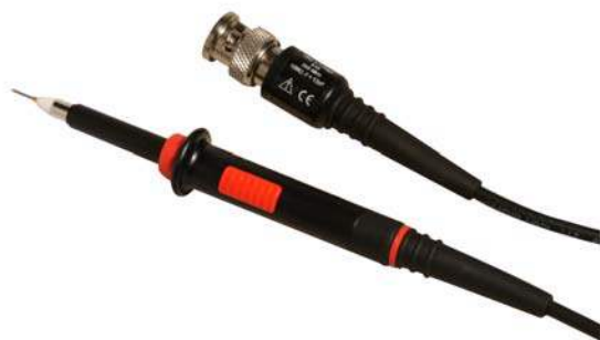
Model 6491 Modular Passive Oscilloscope Probe