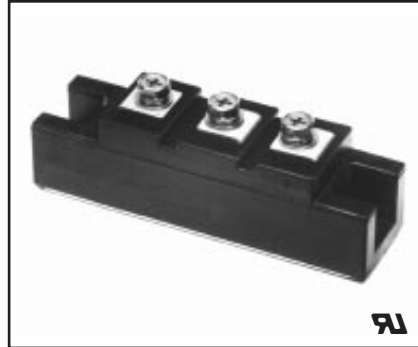
CD411260, CD411660 Dual Diode POW-R-BLOK™ Modules 60 Amperes/1200-1600 Volts