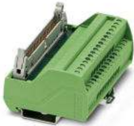
VARIOFACE termination board, to transmit max. 16 channels, only in connection with FLKM 50-PA-SLC 500 OUT/2 A

Please be informed that the data shown in this PDF Document is generated from our Online Catalog. Please find the complete data in the user's documentation. Our General Terms of Use for Downloads are valid ( http://phoenixcontact.com/download )