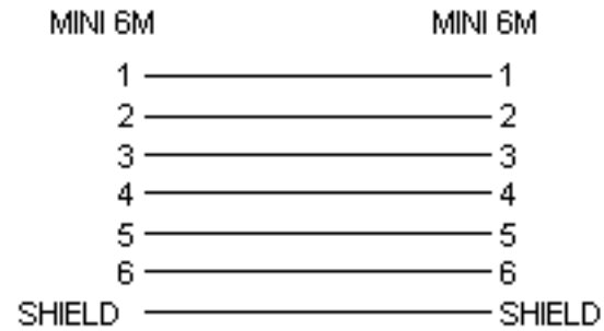
MINI DIN 6M