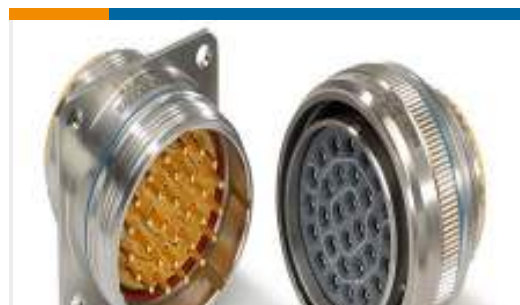
TE Part #ZPF000000000008062 983-6K 08-03 S6 L