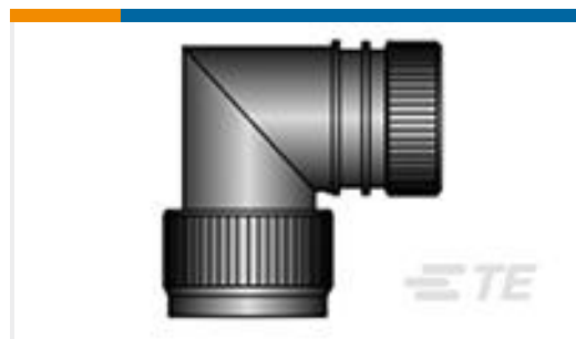
TE Part #437651-000 HEX40-AC-90-15-A5-1