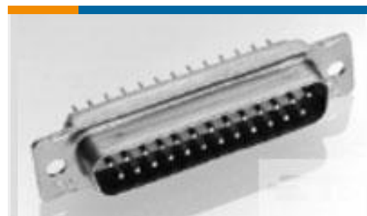
TE Part #1757819-6 AMPLIMITE,ASY,PLUG,STD,109,ZN,1, CT