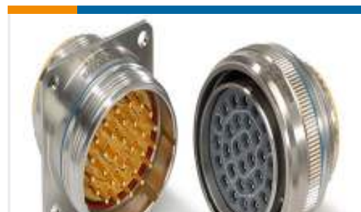
TE Part #ZPF000000000008065 983-6K 08-03 S8 L