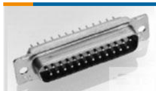
TE Part #1757820-2 AMPLIMITE,ASY,RCPT,STD,109,ZN,2