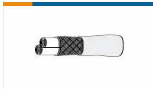
TE Part #169311-000 55A1822-24-9/96-9CS2275