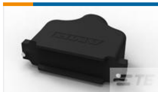
TE Part #5745175-1 CABLE CLAMP KIT,SZ 5