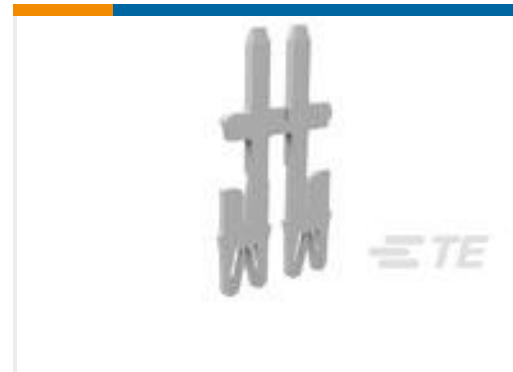
TE Part #2-1601121-2 TAB PAIR,1.50X0.81,FINESMZ