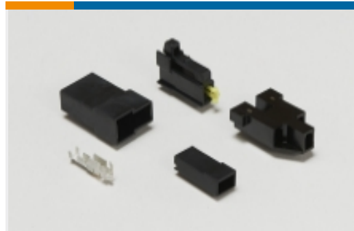
Magnet Wire Terminals(196)