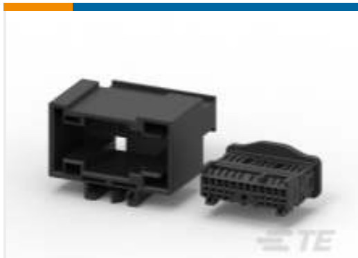
TE Part #953698-3 MQS, CONNECTOR HOUSING