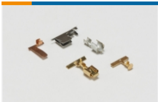
Special Purpose Terminals(1)