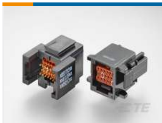
TE Part #ABC06N-20S IN-LINE PLUG