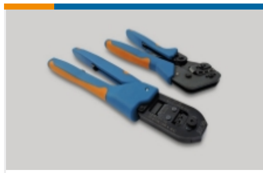
Hand Crimping Tools(2)