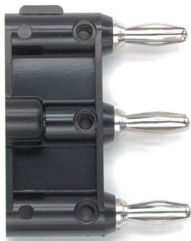
Model 2970 Triple Banana Plug