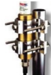
FM2 Mounting Kit (Sold separately)