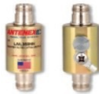
Lightning Arrestor LABH350NN (Sold Separately)