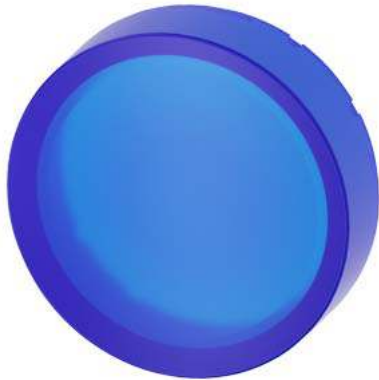
pushbutton, high, blue, for illuminated pushbutton