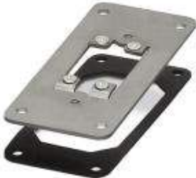
The illustration shows the product version VC-B 10-ADP/2 DSUB 15-M

Mounting adapter plates 1.5 mm thick, with UNC countersunk screws, number of inserts: 2x DSUB 15