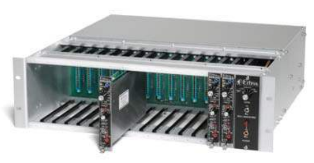
Model R513-16 Sixteen-channel Enclosure

The Model 560H is a versatile, differential dc amplifier with excellent accuracy (0.1%), stability (1 \mu V/°C), frequency response (dc to 200 kHz), and reliability. Its characteristics enable it to be used as a general-purpose amplifier, but its performance allows it to be popular as a dedicated, high-accuracy data-collection amplifier.