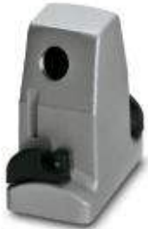
HEAVYCON ADVANCE EMV sleeve housing B6, with bayonet locking, height 100 mm, with 1xM20 thread, lateral cable outlet

Please be informed that the data shown in this PDF Document is generated from our Online Catalog. Please find the complete data in the user's documentation. Our General Terms of Use for Downloads are valid ( http://download.phoenixcontact.com )