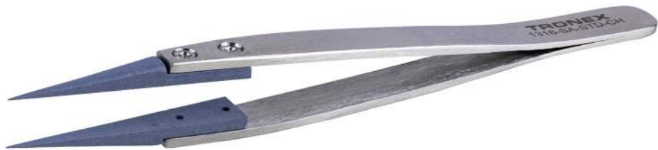
Replacement Tips Item: TIP-STD-16-CH