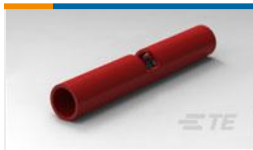
TE Part #2-320559-4 SPLICE BUTT PIDG 22-16; TAPE