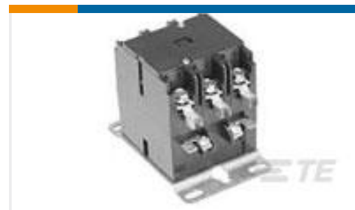
TE Part #4-1611009-6 3100-30Q10999CG=40A 3P 24V MOD