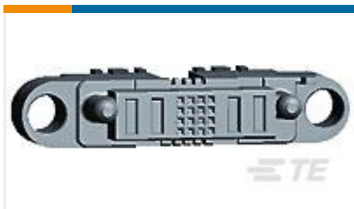
TE Part #1600606-2 PANEL MT RECPT HSG W/GUIDES P