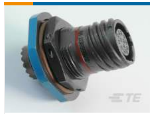
TE Part #YDTS24W13-98PNV001 RECP ASSY