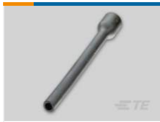
TE Part #807551-000 Low Profile Heat Shrink Boots: Poly Molded, Lipped, Straight