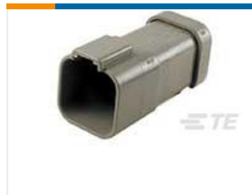
TE Part #DT04-6P-EP04 REC, 6P, GRY, N, CAP