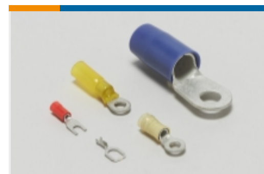
Ring Terminals & Spade Terminals(861)