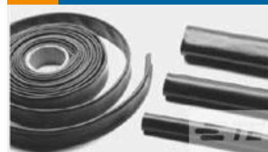
TE Part #CB5051-000 BSTS-17X25