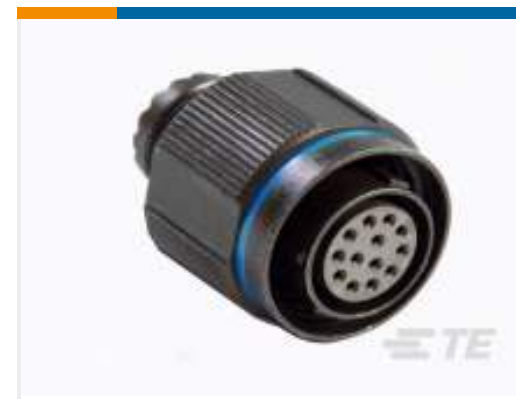
TE Part #YDTS26Z13-98PNV001 PLUG ASSY