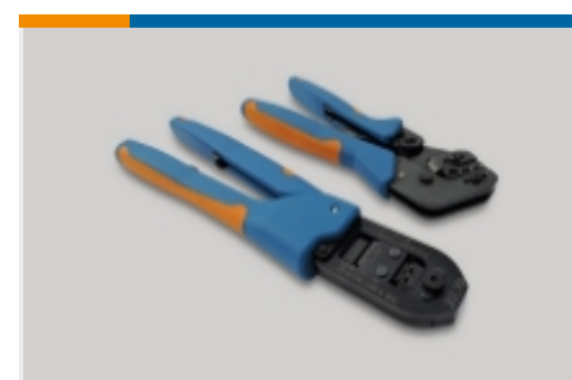
Hand Crimping Tools(2)