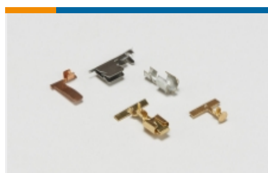
Special Purpose Terminals(1)