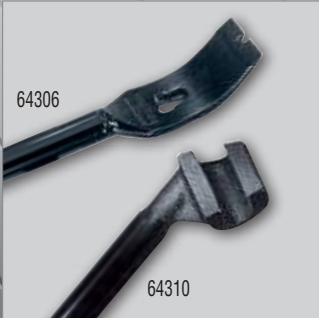
Hickeys & Grizzly Bar