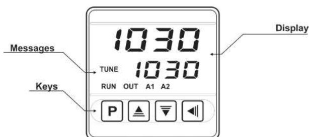
Fig. 02 - Identification of the parts referring to the front panel

The controller's front panel, with its parts, can be seen in the Fig. 02: