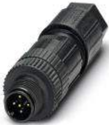
Connector, 5-position, Plug straight M12, A-coded, Spring-cage connection, knurl material: Plastic, external cable diameter 4 mm ... 8 mm

Please be informed that the data shown in this PDF Document is generated from our Online Catalog. Please find the complete data in the user's documentation. Our General Terms of Use for Downloads are valid ( http://phoenixcontact.com/download )