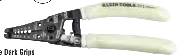
Glow in the Dark Grips