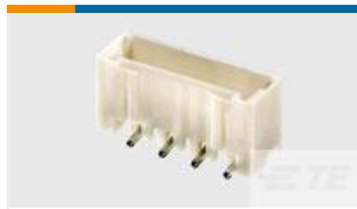
TE Part #292230-4 1.5 MINI CT SGL V SMT W/BOSS 4