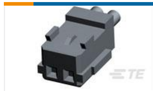
TE Part #2058943-1 Cable Assembly Mini CT 2 pos.