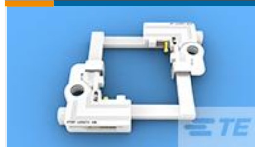
TE Part #5-2154874-3 LED Holder for Cree CXA25XX (1pc)