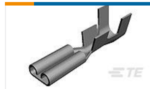
TE Part #140716-2 110 FASTON, REC., 24-22 AWG, PTBR