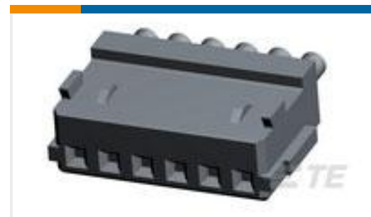
TE Part #2058943-5 Cable Assembly Mini CT 6 pos.