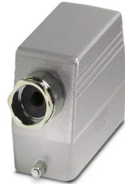
Figure shows product variant with screw connection.

http://eshop.phoenixcontact.de/phoenix/treeViewClick.do?UID=1677746