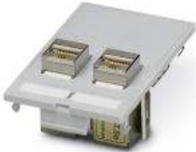
Illustration shows the product version VS-SI-FP-2RJ45-5-MOD-BU/BU

Front plate with contact inserts, plastic, 1x D-SUB 9 and 1x D-SUB 25, socket/pin