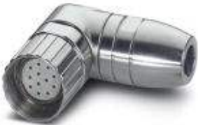
The figure shows the 12-pos. product version

Cable connector, angled, shielded: Yes, Screw locking, M23, Number of positions: 16, Type of contact: Socket, Solder connection, Cable diameter: 3 mm ... 10.5 mm