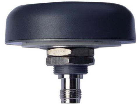
TW3870 Dimensions (mm)