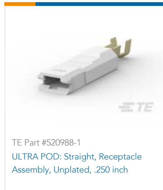
TE Part #520988-1 ULTRA POD: Straight, Receptacle Assembly, Unplated, .250 inch