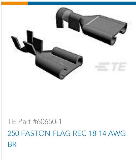
TE Part #60650-1 250 FASTON FLAG REC 18-14 AWG BR