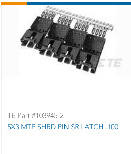
TE Part #103945-2 5X3 MTE SHRD PIN SR LATCH .100