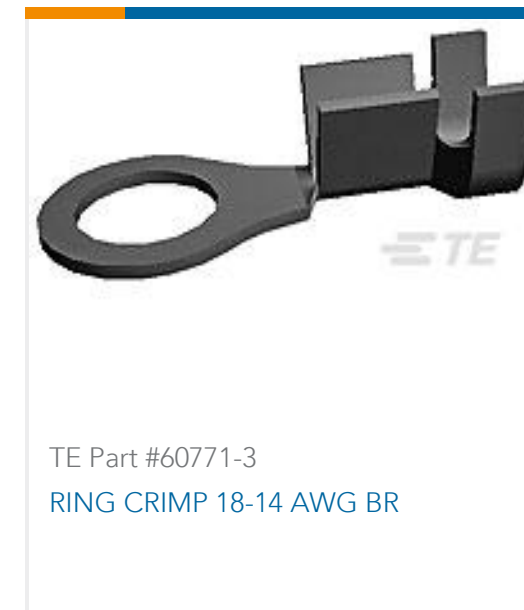
TE Part #60771-3 RING CRIMP 18-14 AWG BR