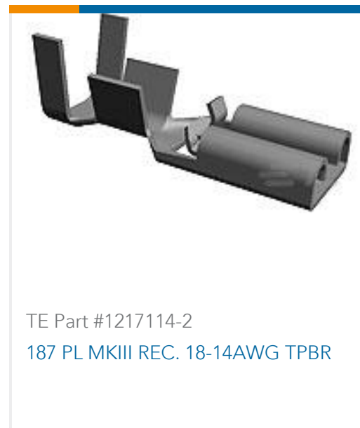
TE Part #1217114-2 187 PL MKIII REC. 18-14AWG TPBR