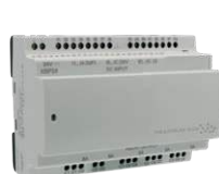
XBP24 Base 24 I/O