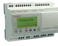
XDP24 Base 24 I/O