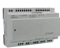
XBP24-E Base 24 I/O Ethernet