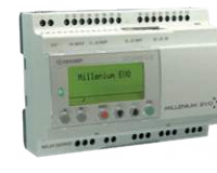
XDP24-E Base 24 I/O Ethernet