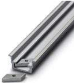
Slide nut, for DIN rail NS 35/15-AL, with M 6 thread, for mounting equipment, material: Steel

Please be informed that the data shown in this PDF Document is generated from our Online Catalog. Please find the complete data in the user's documentation. Our General Terms of Use for Downloads are valid ( http://download.phoenixcontact.com )