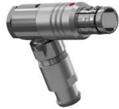
POSITIONS: 10 Positions