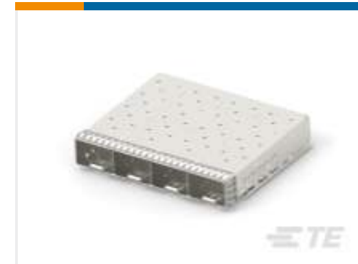
TE Part #2300275-1 zSFP+ 1x4 Cage Assembly, Press-Fit