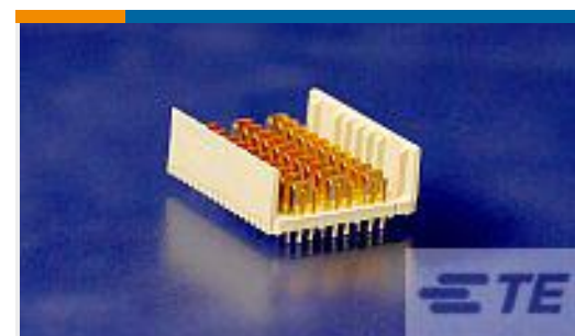
TE Part #6469083-1 HMZD 3PAIR, HDR ASSY, 25MM MOD