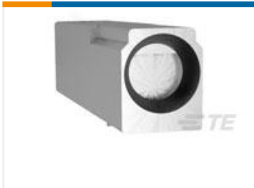
TE Part #5120913-1 UPM KEYED GUIDE MODULE