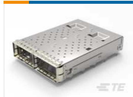
TE Part #2300281-1 CAGE ASSEMBLY, 1X2, QSFP28, SPRING