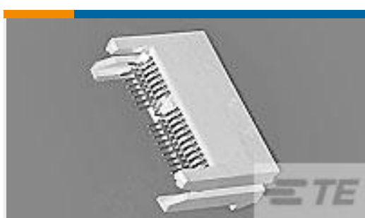
TE Part #3-1734857-4 PCI EXP STRADDLE 98P WHT 15u*