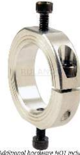
*Additional hardware #101 included