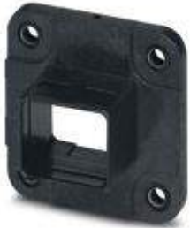
Panel mounting frames, Degree of protection: IP65/67, Material: Plastic

Please be informed that the data shown in this PDF Document is generated from our Online Catalog. Please find the complete data in the user's documentation. Our General Terms of Use for Downloads are valid ( http://phoenixcontact.com/download )