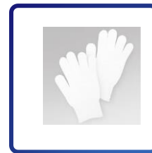
1 pair of Gloves*