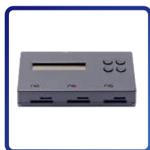
Duplicator x 1