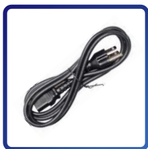
Power Cord x 1