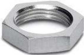
Flat nut with M8 thread

Please be informed that the data shown in this PDF Document is generated from our Online Catalog. Please find the complete data in the user's documentation. Our General Terms of Use for Downloads are valid ( http://download.phoenixcontact.com )