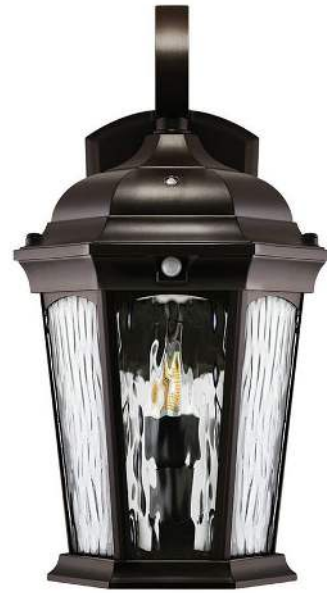
Integrated LED Fixture

*Note: Design, features and specifications subject to change without notice. Some features may not be available on all models. For more information please visit: www.eurilighting.com or call 1-888-743-5766