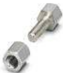
Mounting set, for DSUB gender changer contact inserts