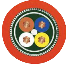
Sercos III [93K]