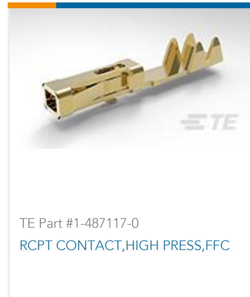
TE Part #1-487117-0 RCPT CONTACT,HIGH PRESS,FFC