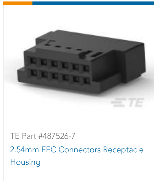
TE Part #487526-7 2.54mm FFC Connectors Receptacle Housing