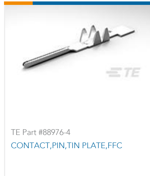
TE Part #88976-4 CONTACT,PIN,TIN PLATE,FFC