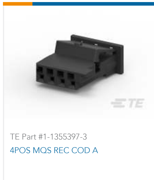
TE Part #1-1355397-3 4POS MQS REC COD A