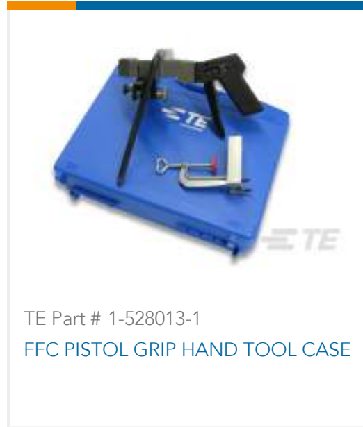
TE Part # 1-528013-1 FFC PISTOL GRIP HAND TOOL CASE