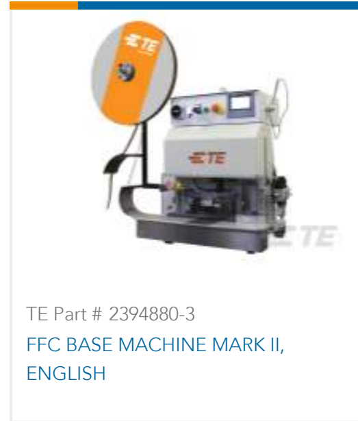
TE Part # 2394880-3 FFC BASE MACHINE MARK II, ENGLISH