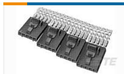
TE Part #1-103956-5 4X5 MTE RCPT SR LATCH .100CL