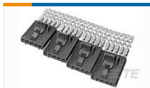
TE Part #5-103956-2 8X3 MTE RCPT SR LATCH .100CL