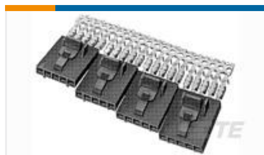
TE Part #5-103956-3 5X4 MTE RCPT SR LATCH .100CL