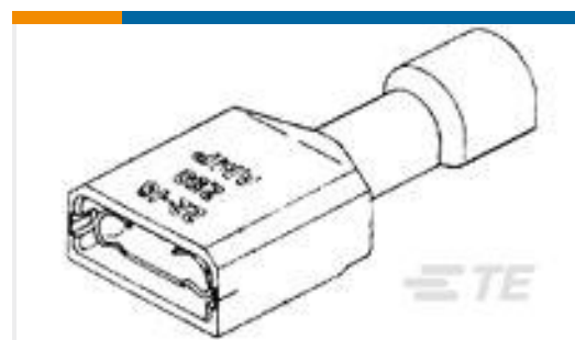
TE Part #2-520403-2 ULTRA-FAST 187 ASY REC 22-18 TPBR