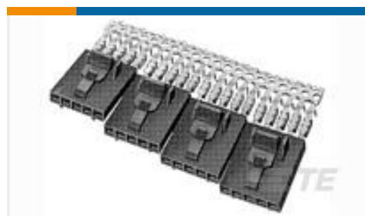
TE Part #5-103957-9 2X10 MTE RCPT SR LATCH .100CL