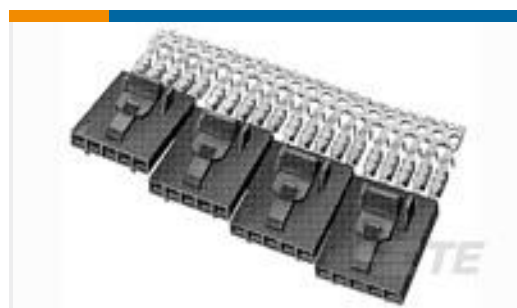
TE Part #5-103956-6 2X7 MTE RCPT SR LATCH .100CL