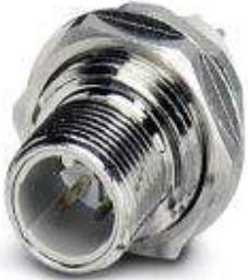
Sensor/Actuator flush-type plug, 4-pos., M12, A-coded, rear/screw mounting with Pg9 thread, with straight solder connection

Please be informed that the data shown in this PDF Document is generated from our Online Catalog. Please find the complete data in the user's documentation. Our General Terms of Use for Downloads are valid ( http://download.phoenixcontact.com )