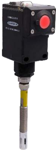
(Shown with the temperature/humidity sensor connected)

Sure Cross® Wireless Q45 Sensors combine the best of Banner's flexible Q45 sensor family with its reliable, field-proven, Sure Cross wireless architecture to solve new classes of applications limited only by the user's imagination. Containing a variety of sensor models, a radio, and internal battery supply, this product line is truly plug and play.