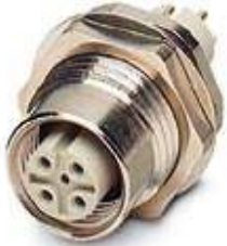
Sensor/Actuator flush-type socket, 4-pos., M12, A-coded, rear/screw mounting with Pg9 thread, with straight solder connection

Please be informed that the data shown in this PDF Document is generated from our Online Catalog. Please find the complete data in the user's documentation. Our General Terms of Use for Downloads are valid ( http://download.phoenixcontact.com )