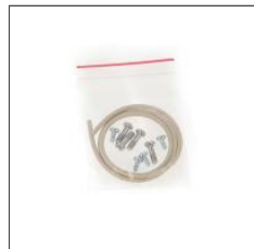
Hardware includes lid screws, PC board screws, and gasket