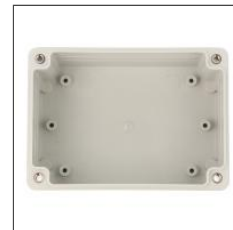
Internal mounting points for PC boards or panels