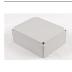
Some models supplied with styled lid.