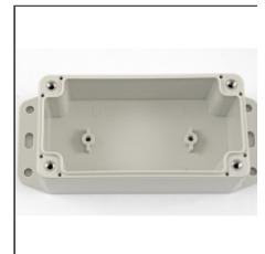
Internal DIN rail mounting point.