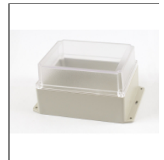
Some models supplied with deep lids.