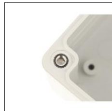
Features corrosion resistant inserts for lid assembly