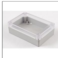
Clear Lid (polycarbonate version shown)